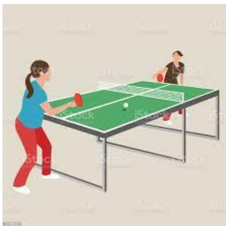
Table Tennis at the Village Hall